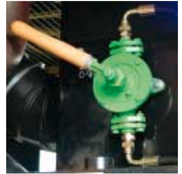
Manual oil drain pump