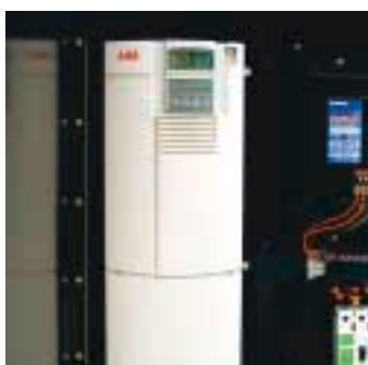
Cooling fan VSD variable speed system