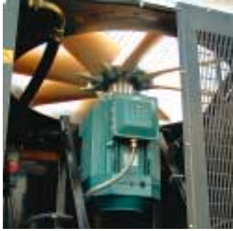
ABB variable speed cooling fan and cooler compartment