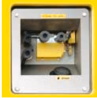
Fuel connection and electric transfer fuel pump