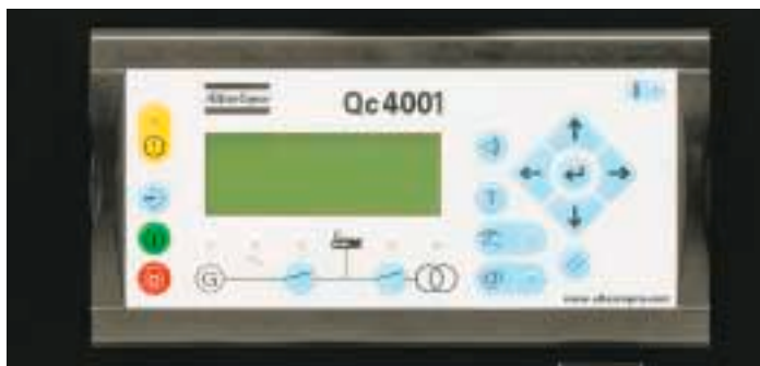
Automatic mains failure and parallel operation between multiple gensets and the mains