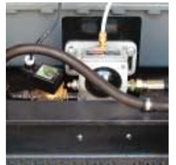
Automatic oil filler (Automatic Oil Make Up System)