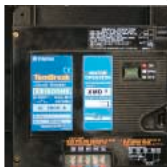
TERASAKI motorised 1500 A circuit breaker