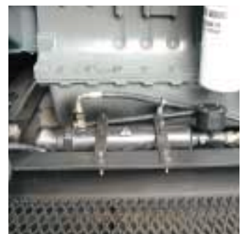
Coolant heater 6 kW